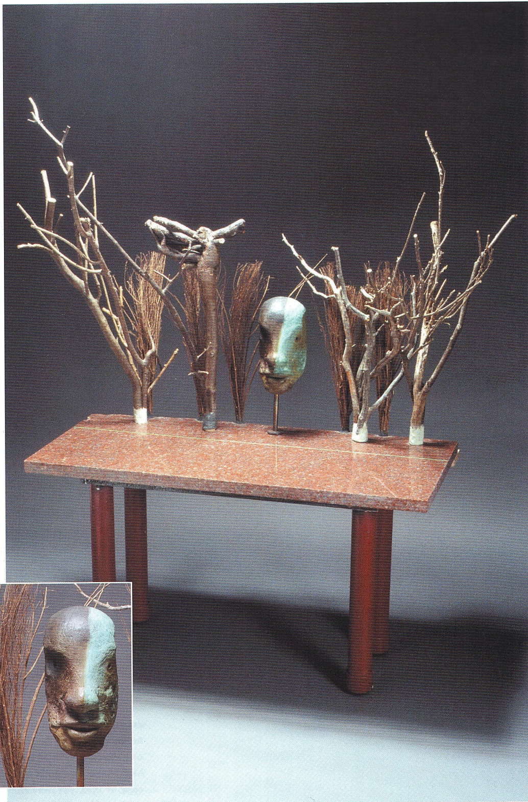
Title of Work Pictured: Table of Dunnamite Dan Medium: Granite, bronze, tree twigs, metal legs. Description: Slab of red granite; metal legs; 8 groups of twigs and branches with bronze mask; 40" x 18" x 24"

TALKING FURNITURE DESIGN: THE LANGUAGE OF CONTEMPORARY SOUTHEASTERN ARTISANS